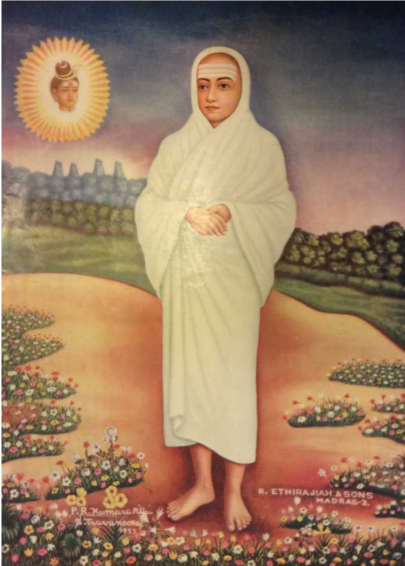
FIGURE 1. Ramalinga Swamikal.

teachings, but he did not live in a nostalgic world of tradition. His projects sought to address the social inequality and poverty that characterized his world.