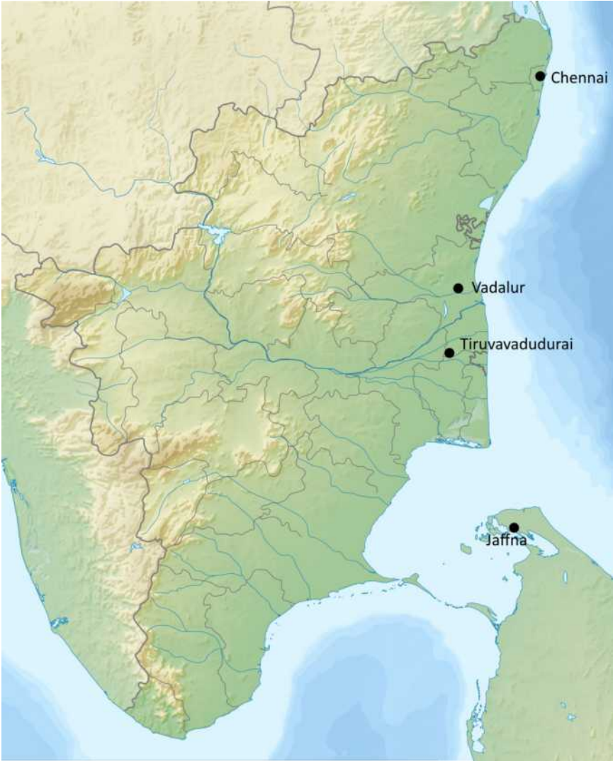
MAP 1. India and Sri Lanka.

of Shaiva devotional and scholarly activity. His relationship with powerful Shaiva monasteries was at times strained, a result of his middling caste status and the critical spirit of his writing. His position on the periphery of colonial activity and Shaiva institutional power provided an ideal space in which he advanced a critical and creative reformulation of Shaiva traditions. In the last years of his life, he attempted to transform Vadalur into a “northern Chidambaram” that would provide an institutional alternative to existing Shaiva centers of power.